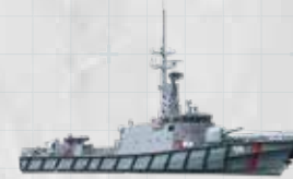
SENTINEL-CLASS MARITIME SECURITY AND RESPONSE VESSEL

Length: 80 metres Speed: In excess of 27 knots Displacement: 1,250 tonnes