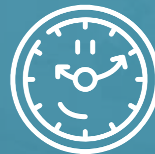
Flexible work arrangements