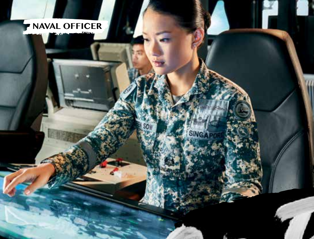
NAVAL WARFARE SYSTEM EXPERT