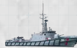
SENTINEL-CLASS MARITIME SECURITY AND RESPONSE VESSEL

Length: 80 metres Speed: In excess of 27 knots Displacement: 1,250 tonnes